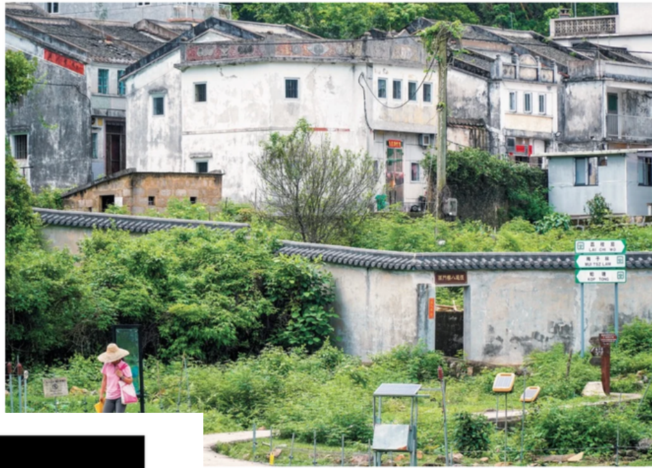
the New Territories.