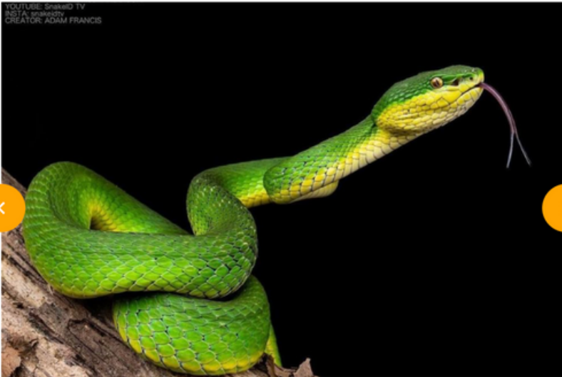
A bamboo pit viper.